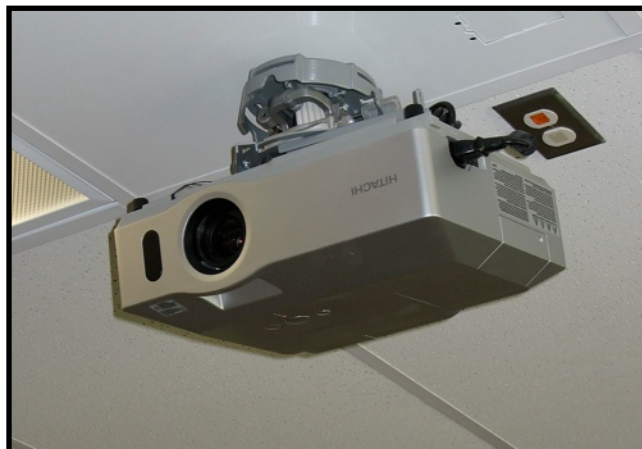
Mounted projector in Glenclyff classroom.

Glenclyff 5 th grades are now using their new technology teaching stations. These stations include document cameras, DVD/VHS players, and ceiling-mounted LCD projectors. Teachers report that it's great having all of this powerful technology so readily accessible! The other intermediate-level classrooms will be receiving their new capabilities as capital project work progresses.